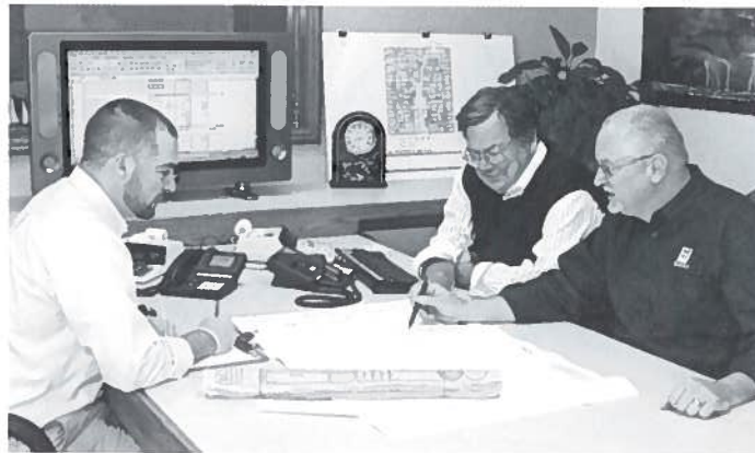
Using technology on bid day.